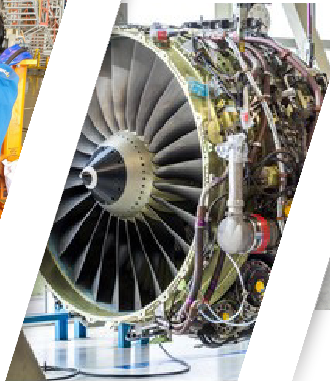
Aircraft Engines & Spare Parts