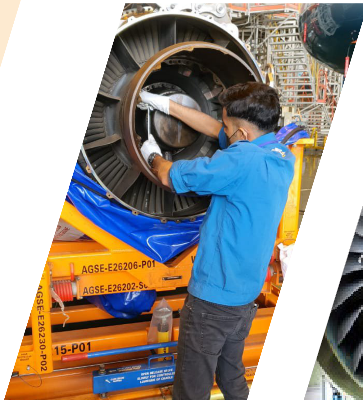
Aviation Training Program